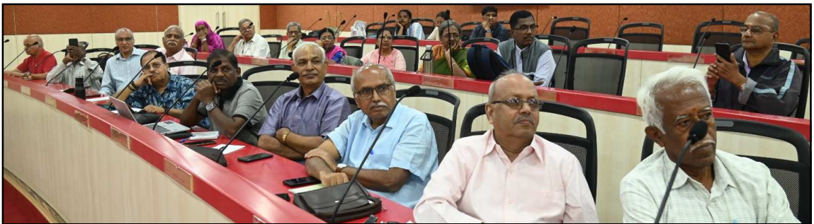
Participant Pensioners at Digital Literacy Training Programme

Our thanks to all the participants of the programme and to all who made this programme a grand success.