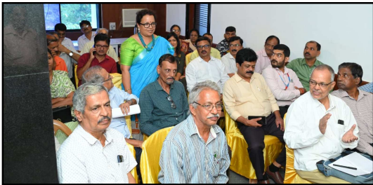
Assembly of Pensioners- Mangalore