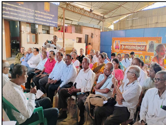
(Left) Pensioner aged 80 felicitated by Shivamogga Pensioners association speaking. (Right) Assembly of Pensioners.