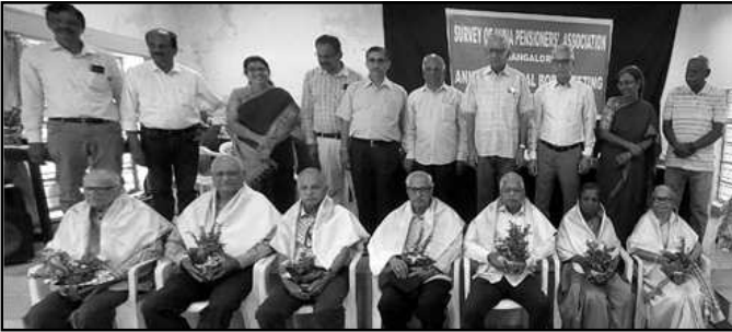
Pensioners aged 80 honoured