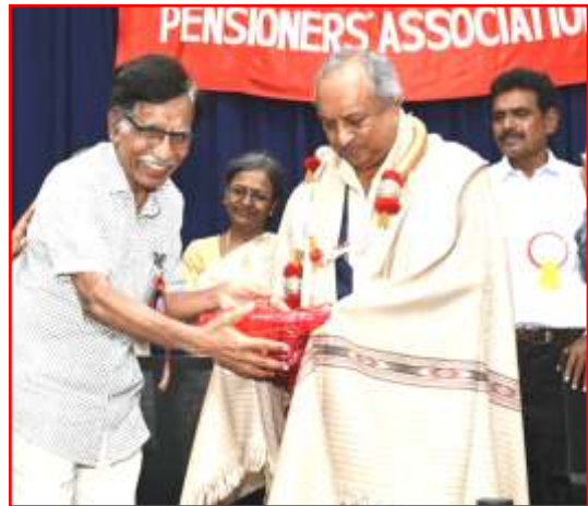
Chief Guest being honoured by the President