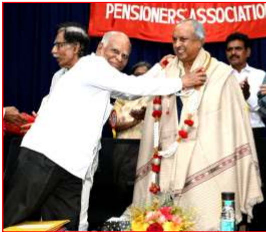
The Chief Guest being honoured by the Secretary