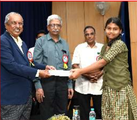
Chief Guest giving Cash Awards to the Students