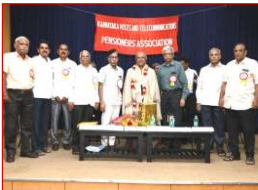
Chief Guest Felicitated